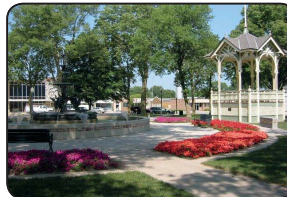
Lake City Town Square