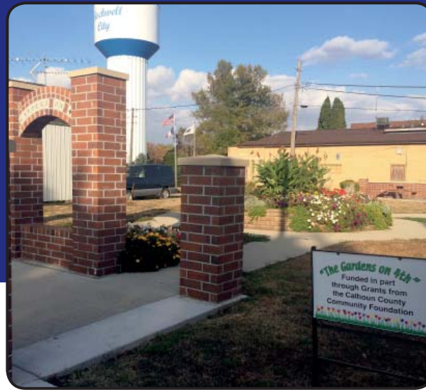
The Gardens on 4th, Rockwell City

The Calhoun County Community Foundation is governed by a local board of directors who are active in their local communities. Board members and alternates were selected by the local city councils or other governing boards to represent their community.